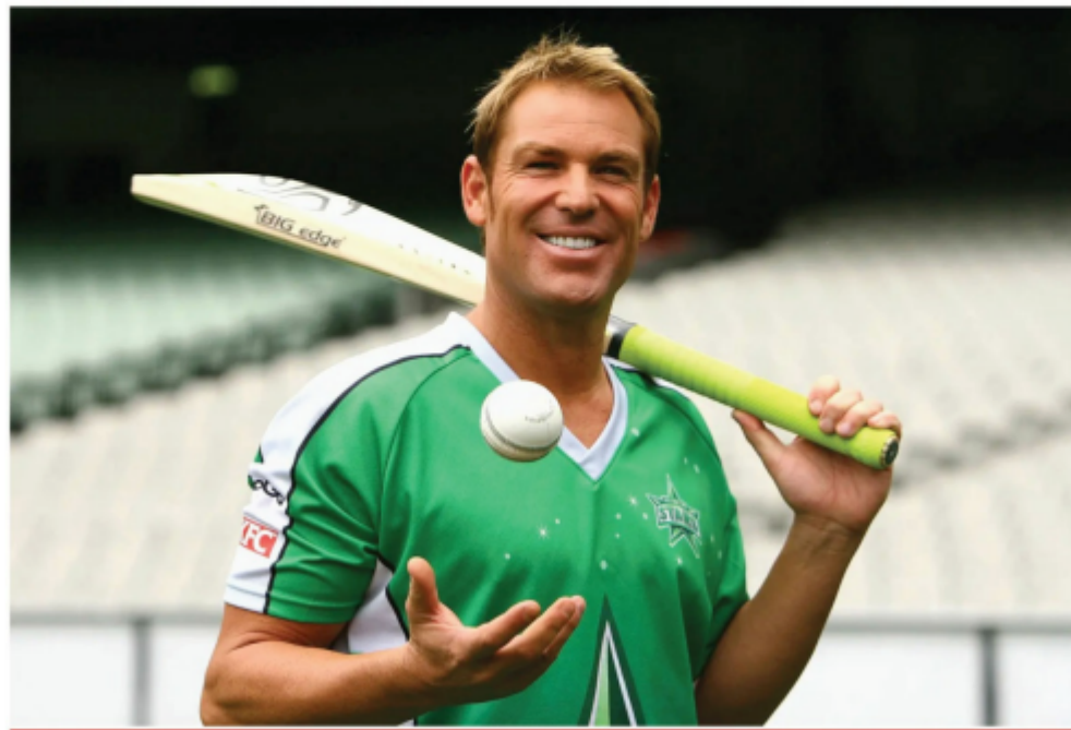
Shane Warne — survived by his three children — died of a suspected heart attack.