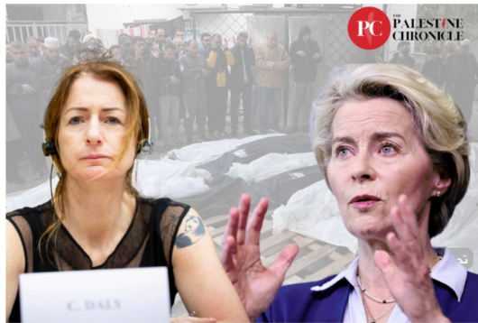
Clare Daly and Ursula von der Leyen.

© December 26, 2023 → Blog, News, Videos