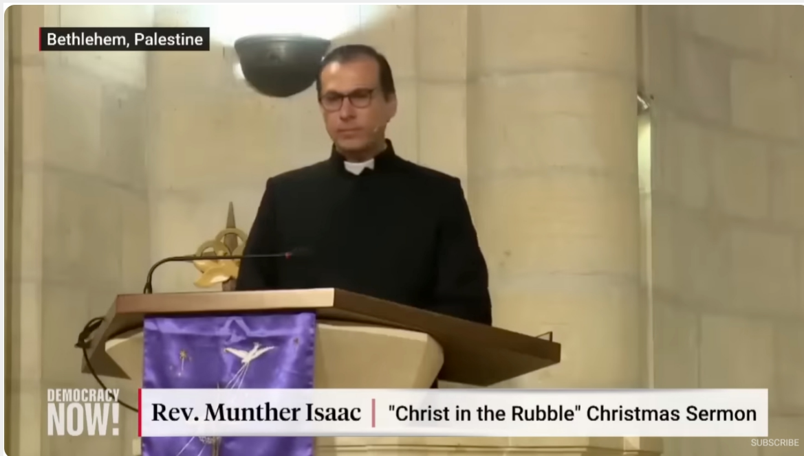
"Christ in the Rubble": Palestinian Pastor Delivers Powerful Christmas Sermon from Bethlehem